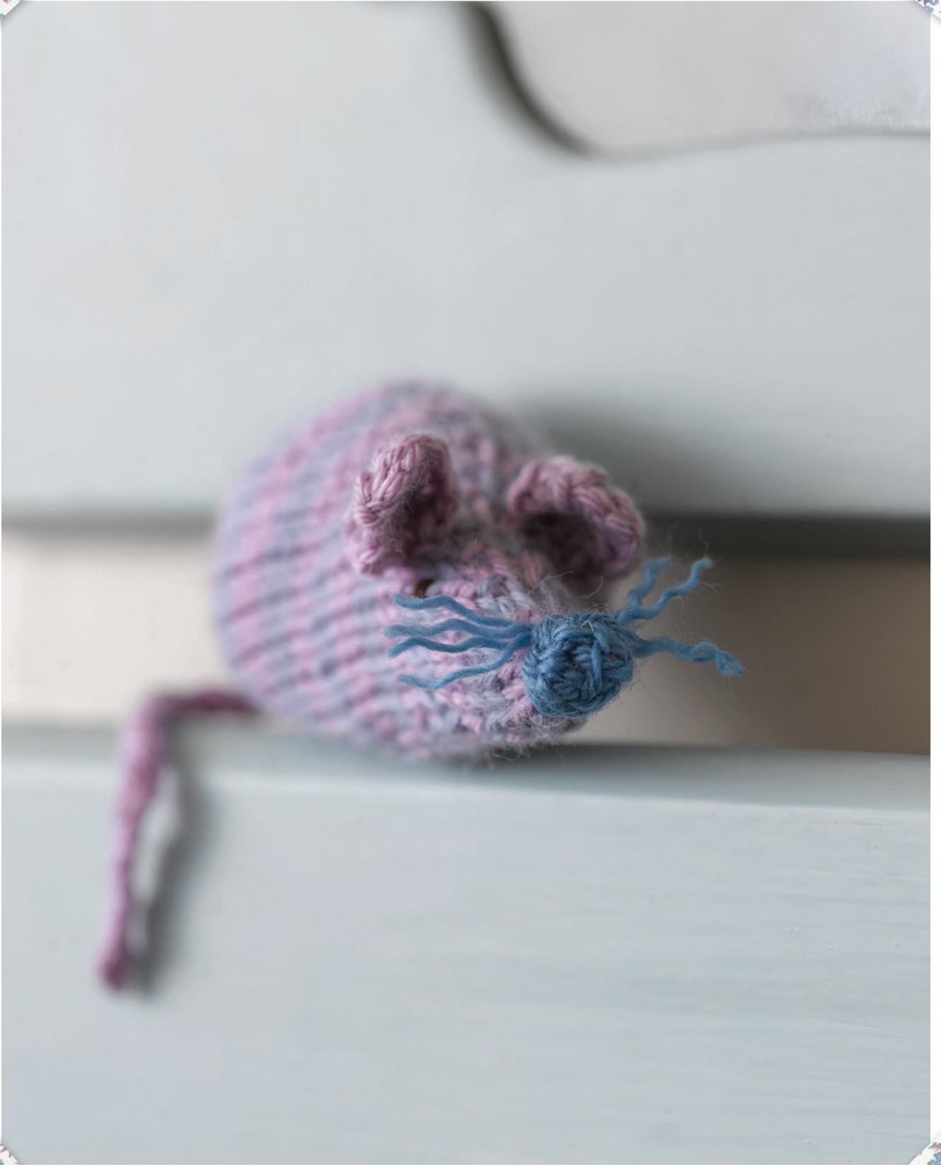
little mice running round and round ...